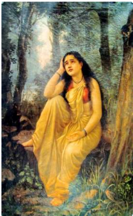
(Artist: Raja Ravi Varma Date: 1448-1906)

Can you leave behind both joy and sorrow! O mortal!