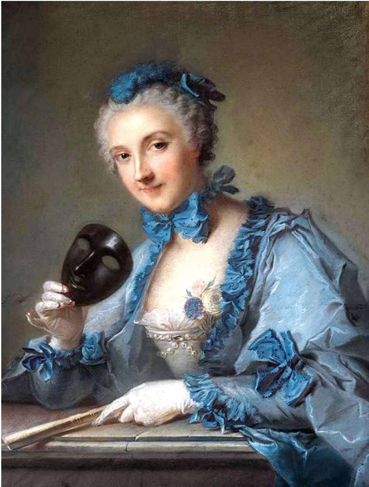
(Artist: Jean-Marc Nattier Date: 1685-1766)