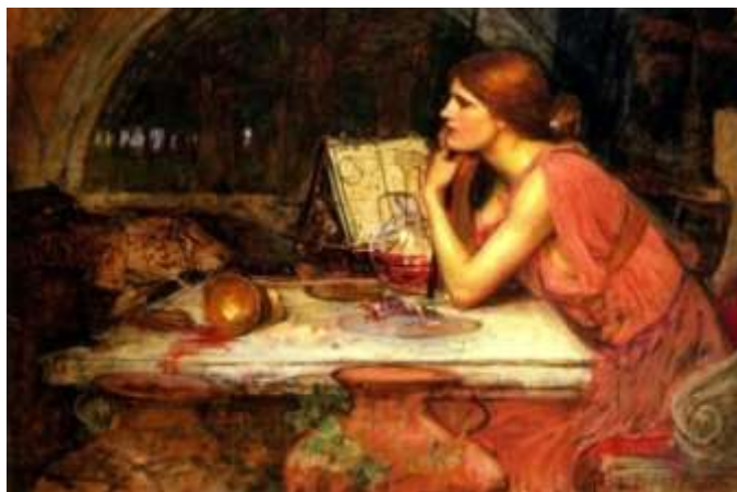
(Artist: John William Waterhouse Date: 1849-1917)