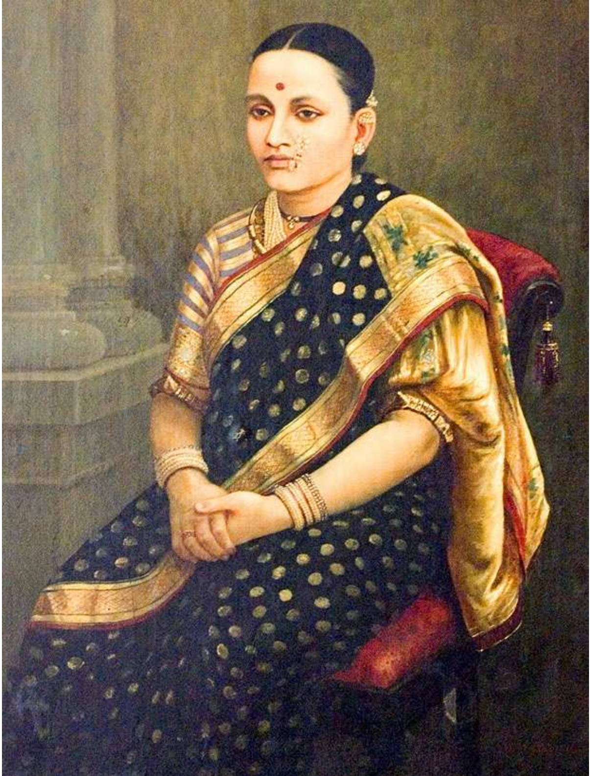
(Artist: Raja Ravi Varma Date: 1848-1906)